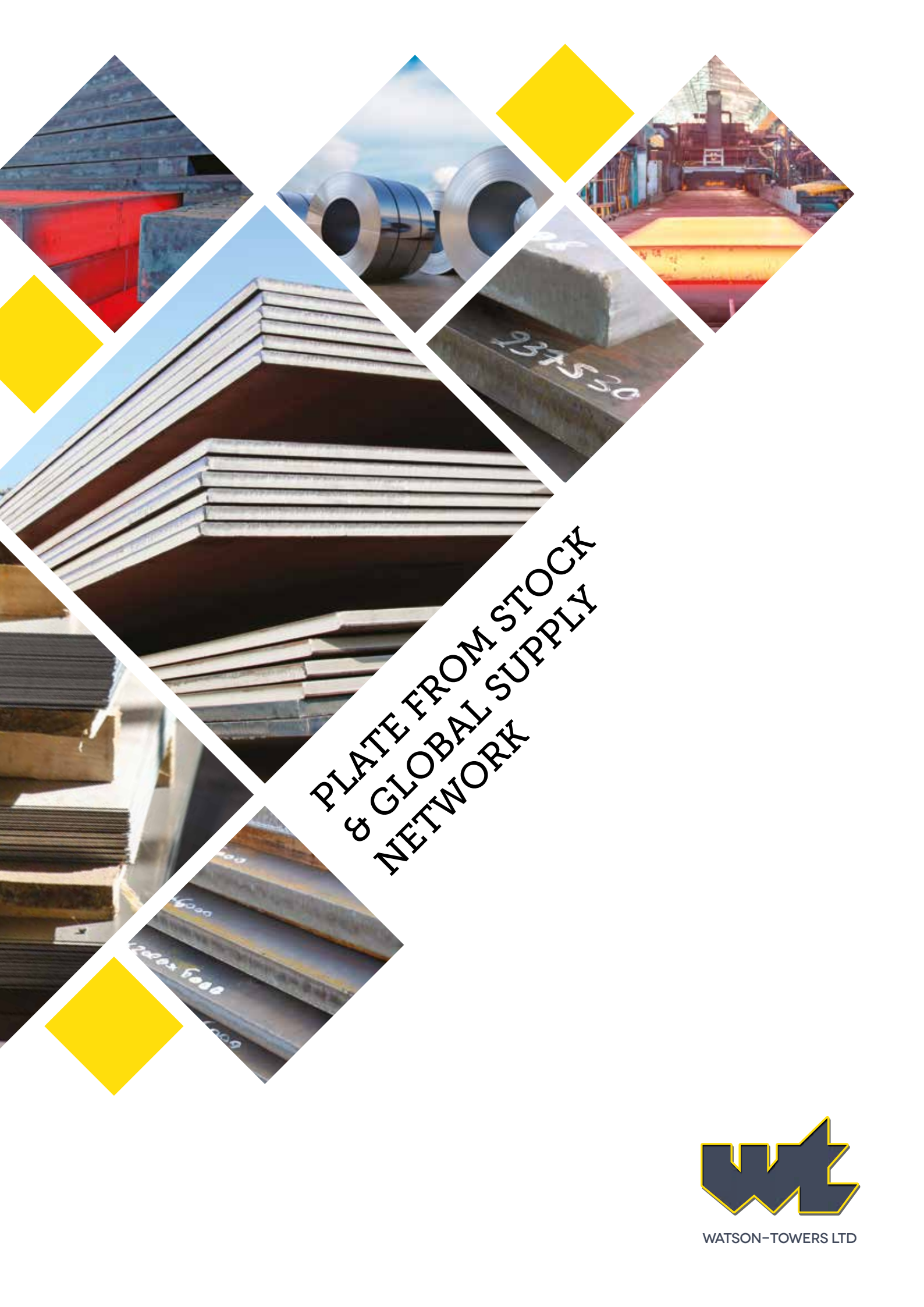
PLATE FROM STOCK & GLOBAL SUPPLY NETWORK