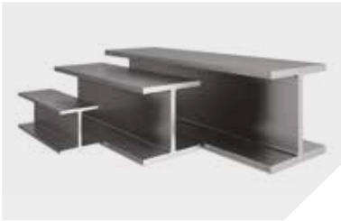
Universal Beams & Columns